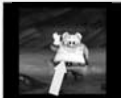
Subject correctly centred.

To direct Jade when fighting, see the Combat & Special Attack section.