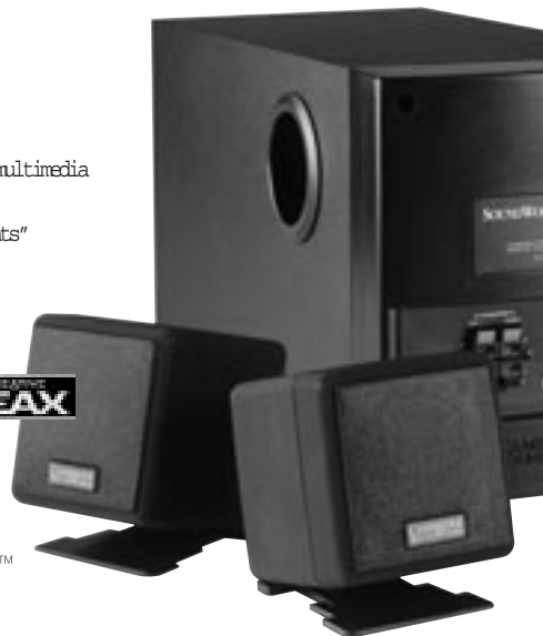
SoundWorks® Digital Amplified Subwoofer/Satellite Multimedia Speaker System by Cambridge SoundWorks